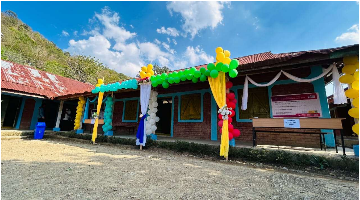
A model polling station in Kamjong district.

3. In addition, 9 special polling stations have been set up for Internally Displaced Voters, 4 nos. in Ukhrul, 4 nos. in Tengenoupal and 1 no. in Jiribam districts. A total of 529 Internally Displaced Voters will exercise their franchise in their respective Special Polling Stations tomorrow. Interestingly, a special polling station has been set up for only 1 voter in Tengenoupal district. Over 3400 polling personnel are being deployed for Phase 2.