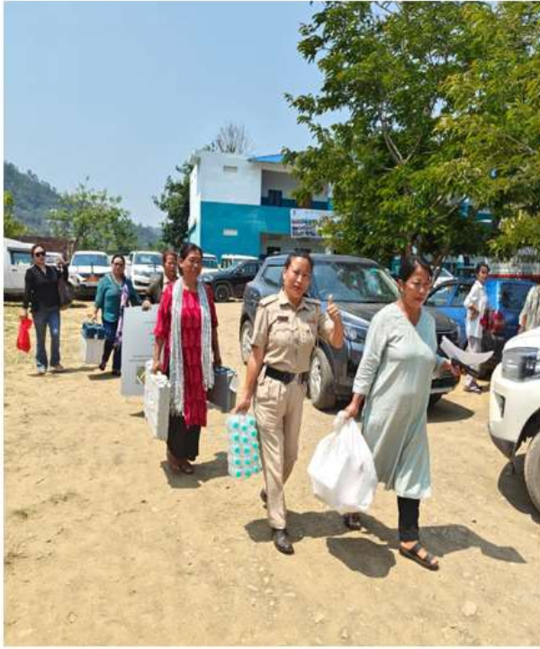
Women polling parties of Tengenoupal