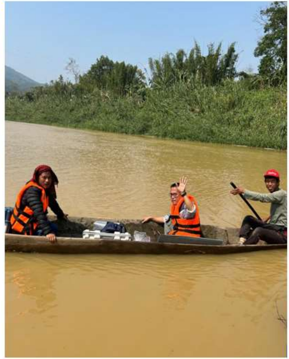
Polling team of Jiribam kayaking through Barak river

3. In addition, 9 special polling stations have been set up for Internally Displaced Voters, 4 nos. in Ukhrul, 4 nos. in Tengenoupal and 1 no. in Jiribam districts. A total of 529 Internally Displaced Voters will exercise their franchise in their respective Special Polling Stations tomorrow. Interestingly, a special polling station has been set up for only 1 voter in Tengenoupal district. Over 3400 polling personnel are being deployed for Phase 2.