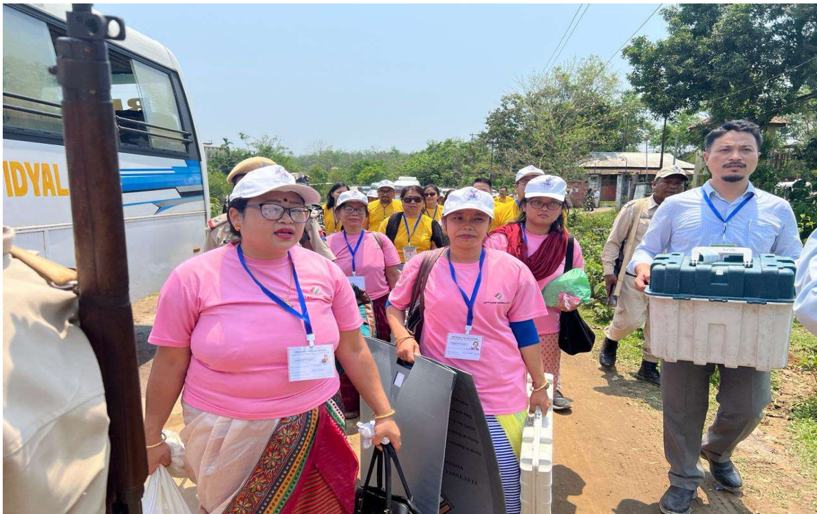
Women polling personnel at Jiribam district.

No. COE-101/3/2023-ELEC-ED: The second phase of General Elections to the 18 th Lok Sabha in respect of Manipur State has been scheduled tomorrow i.e. 26 th April, 2024 (Friday). Polling will start at 7 AM and will continue till 4 PM. Thirteen Assembly Segments of 2-Outer Manipur (ST) Parliamentary Constituency spread across 8 districts viz Ukhrul, Kamjong, Tamenglong, Noney, Senapati, Jiribam, Pherzawl & Tengnoupal, will go for polls tomorrow. A total of 484949 voters including 239140 male, 245807 female and 2 transgender voters will exercise their franchise in Phase-2. There are a total of 848 polling stations including 36 nos. of P-3 polling stations and 279 nos. of P-2 polling stations and 533 nos. of P-1 polling stations.