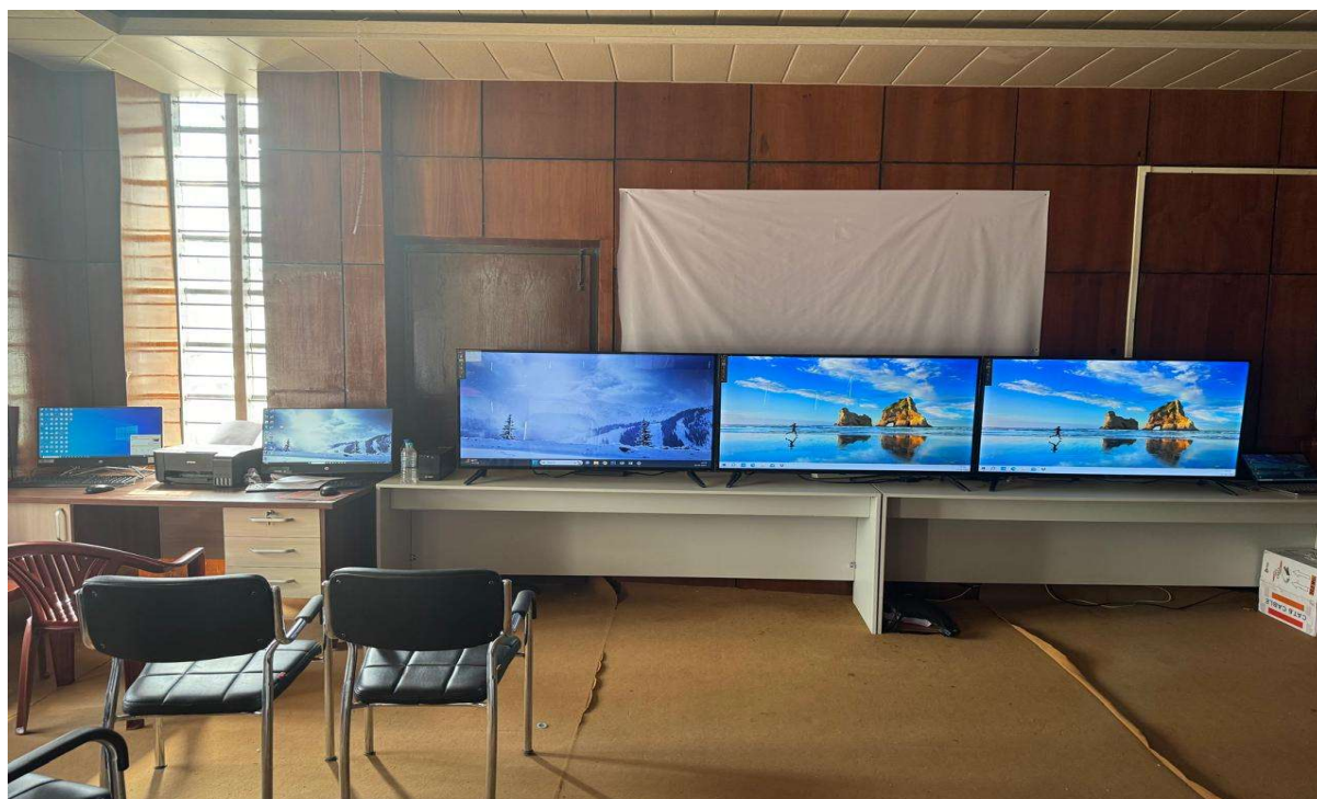
Election Control Room set up at the office of District Election Officer, Pherzawl

7. Similarly as done in Phase 1, the movement of EVMs is being tracked with the help of e-Traccar App which is embedded in the mobile phones of Polling personnel and Sector Officers. Besides, a polling personnel will be able to report any sort of EVM malfunctioning or any untoward incident happening in the polling station. Poll Star App is also used for timely reporting of voter turn out and other vital information by the Polling Officials. Control Rooms have been set up in every District Headquarter and in the Office of Chief Electoral Officer, Manipur.